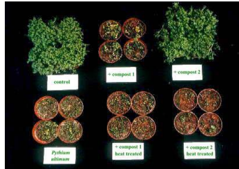
Figure 1: A high quality compost with an active microflora protects plants from diseases (compost 2), whereas a compost of low microbial activity shows almost no effect (compost 1). If the active compost is heat treated, its active microflora is destroyed and loses its potential to suppress pathogens. In this case the disease develops better compared to the untreated control. The pathogen fungus can develop easy in such a medium.