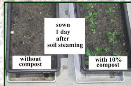
Fig. 3: Influence of compost on the phytotoxicity of lamb's lettuce.