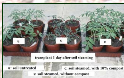
Fig. 2: Influence of compost on the phytotoxicity of tomato seedlings.